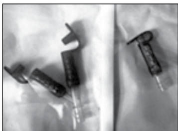
Dual and single ports