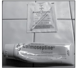
I use barrier cream and a split 2" x 2"

If you plan to prepare your own food, get some guidance from a nutritionist with expertise in ALS and tube feeding.