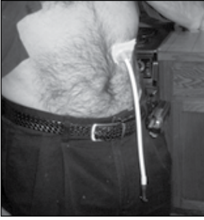
My tube is about a foot long