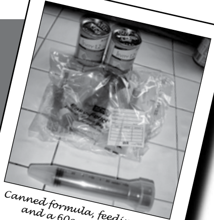
Canned formula, feeding set, and a 60cc syringe in its handy case.

A CONSUMER'S GUIDE TO LIVING AND EATING WITH A PEG TUBE