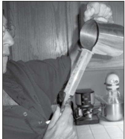
Flush tube with water

You will start out slowly. In fact, at first you will probably despair that you have given over your active life to a feed bag. But you can build up the rate gradually, and find out what works for you. I can pour an 8-ounce can down in about 2 minutes, but I take 30-45 minutes for a two-can meal.