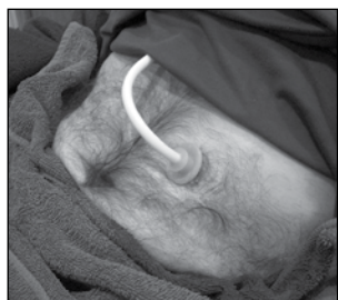
A bumper holds tube in place