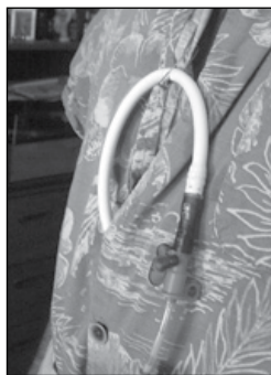
A safety pin secures the tube

You will probably start gradually, getting some of your nutrition from the tube while continuing to eat. Your health care team will help you determine a schedule. It may start with one can on the first day, increasing by a can a day up to your prescribed daily intake. Your individual schedule will be modified according to your needs and how well you tolerate this new way of eating.