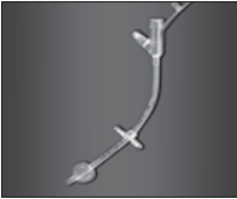
PEG tube with a balloon