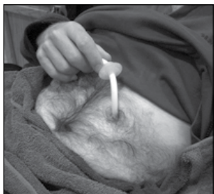
Tube comes out through abdominal wall