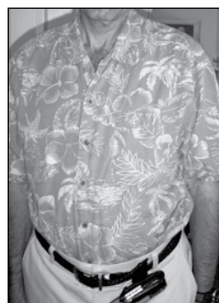
The tube doesn't show!