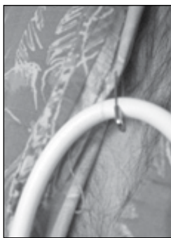
Tube passes through the arms of the pin